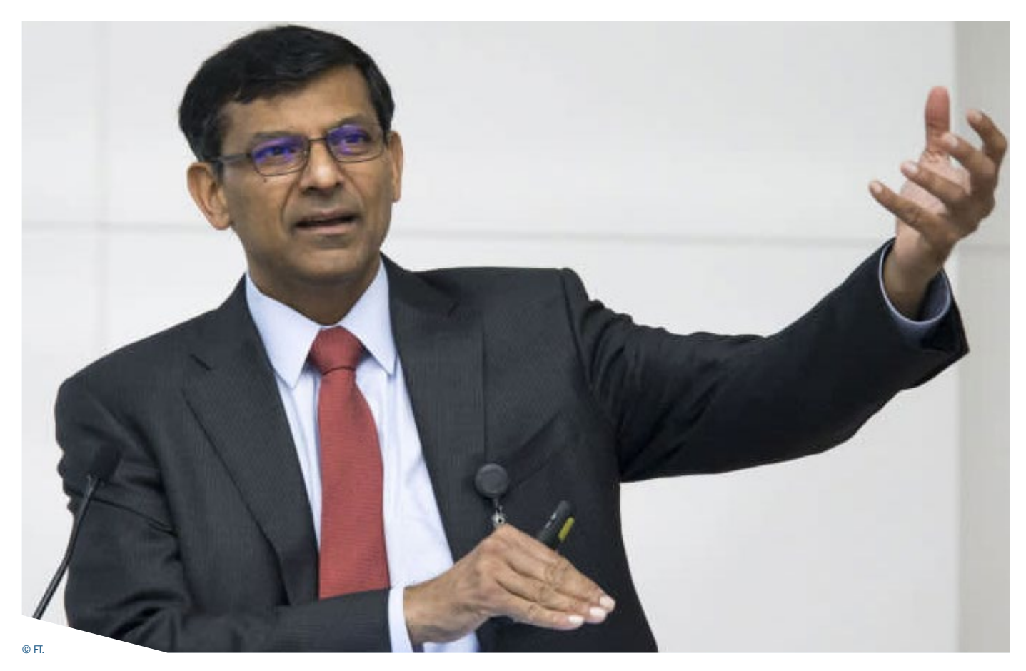
Raghuram Rajan, former Reserve Bank of India governor: 'Blaming it all on the outside is too easy'