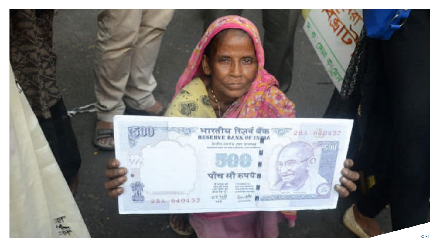
Narendra Modi's cash ban invalidated overnight 86% of the country's currency in circulation

show. From 2012 to 2018, household savings fell from 23.6 to 17.2 per cent of GDP. Household debt has risen sharply, though at 11 per cent of GDP it remains low by regional standards.